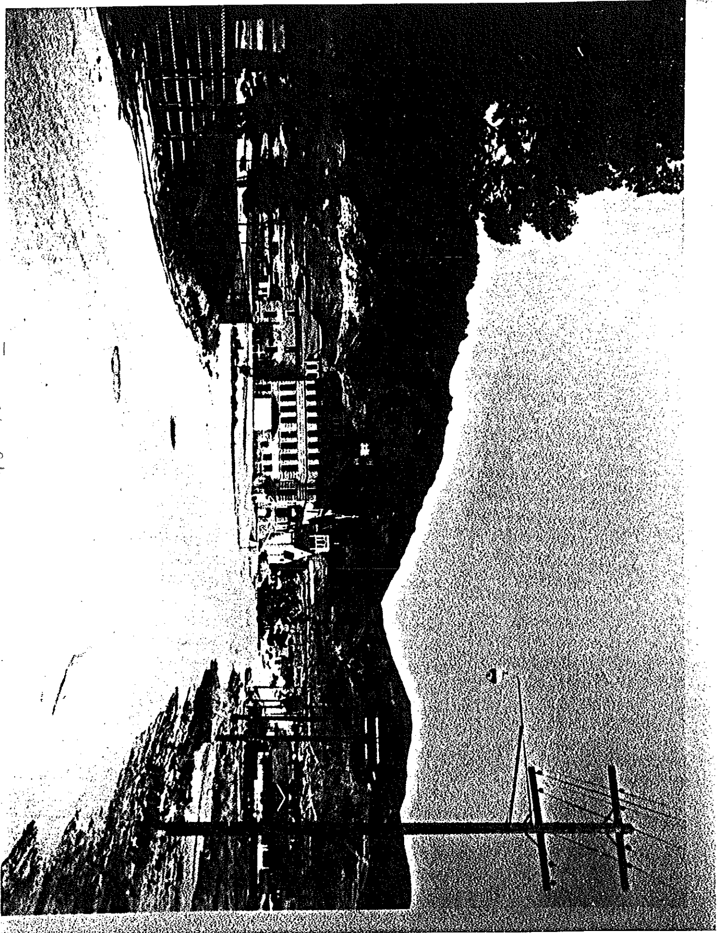
Holy Saviour Church