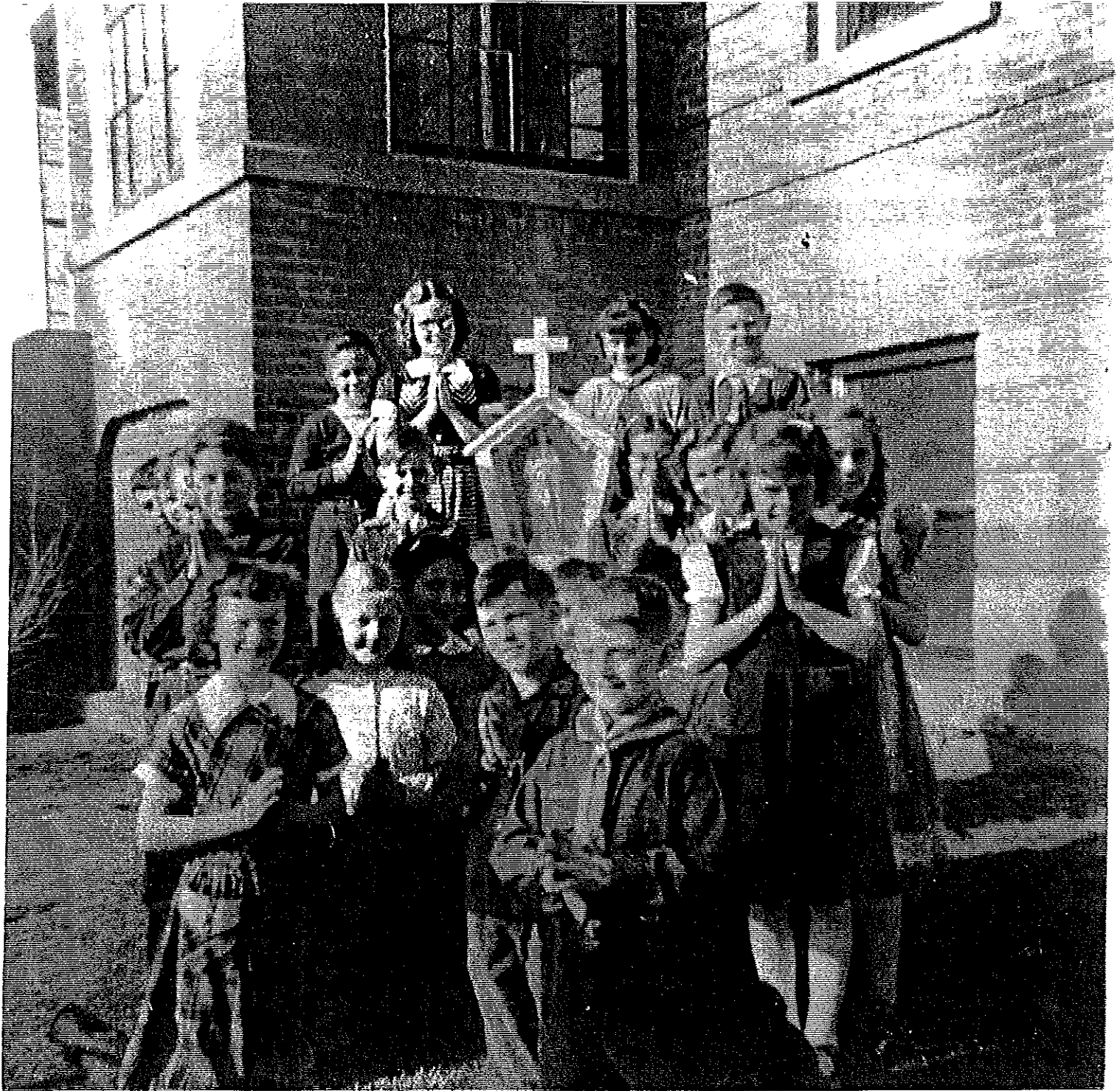
Holy Saviour Class 1952 Holy Saviour School